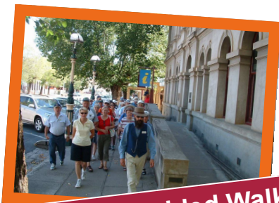
Echoes of History Guided Walking Tour

Learn about Beechworth's iconic history 10.15 am daily – Duration 1 hr & 15 mins