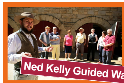
Ned Kelly Guided Walking Tour

Learn about Beechworth's iconic history 10.15 am daily – Duration 1 hr & 15 mins