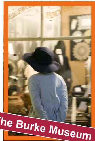
The Burke Museum

Learn about bushrangers, life on the gold fields, Chinese miners and lots more! Explore the 'street of shops' and search for items on the 'Look and Find' activity sheet.