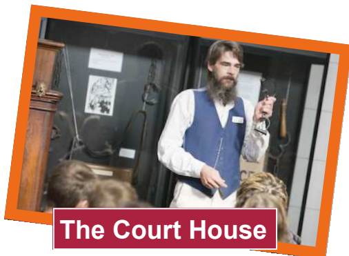
The Court House

Stand in the dock where bushranger Ned Kelly was tried. Play judge and jury and sentence your family to time in the prisoner's holding cells.